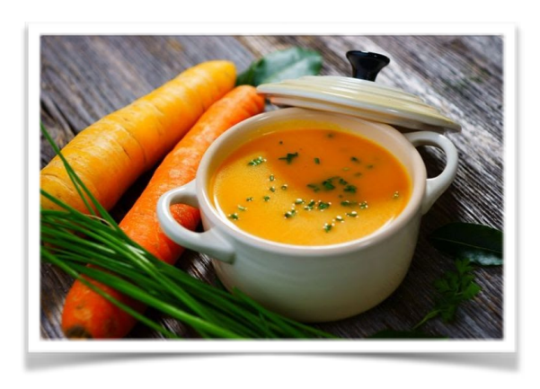
healthy -- your breakfast will be!

4. Be smooth. Grab that blender and put it to work! When you're making your favorite fruit smoothie, add in a frozen banana and some spinach, carrots, squash or just about any vegetable (cooked is easier to blend, FYI). The frozen banana makes for a sweet, thick, and creamy smoothie and it adds a strong banana flavor that helps hide the flavor of the veggies. Want a more colorful smoothie? Try adding beet, avocado or sweet potato to change the tint. You'll be surprised at how bright – and