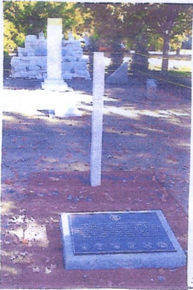
POST 76 CENTENNIAL MEMORIAL