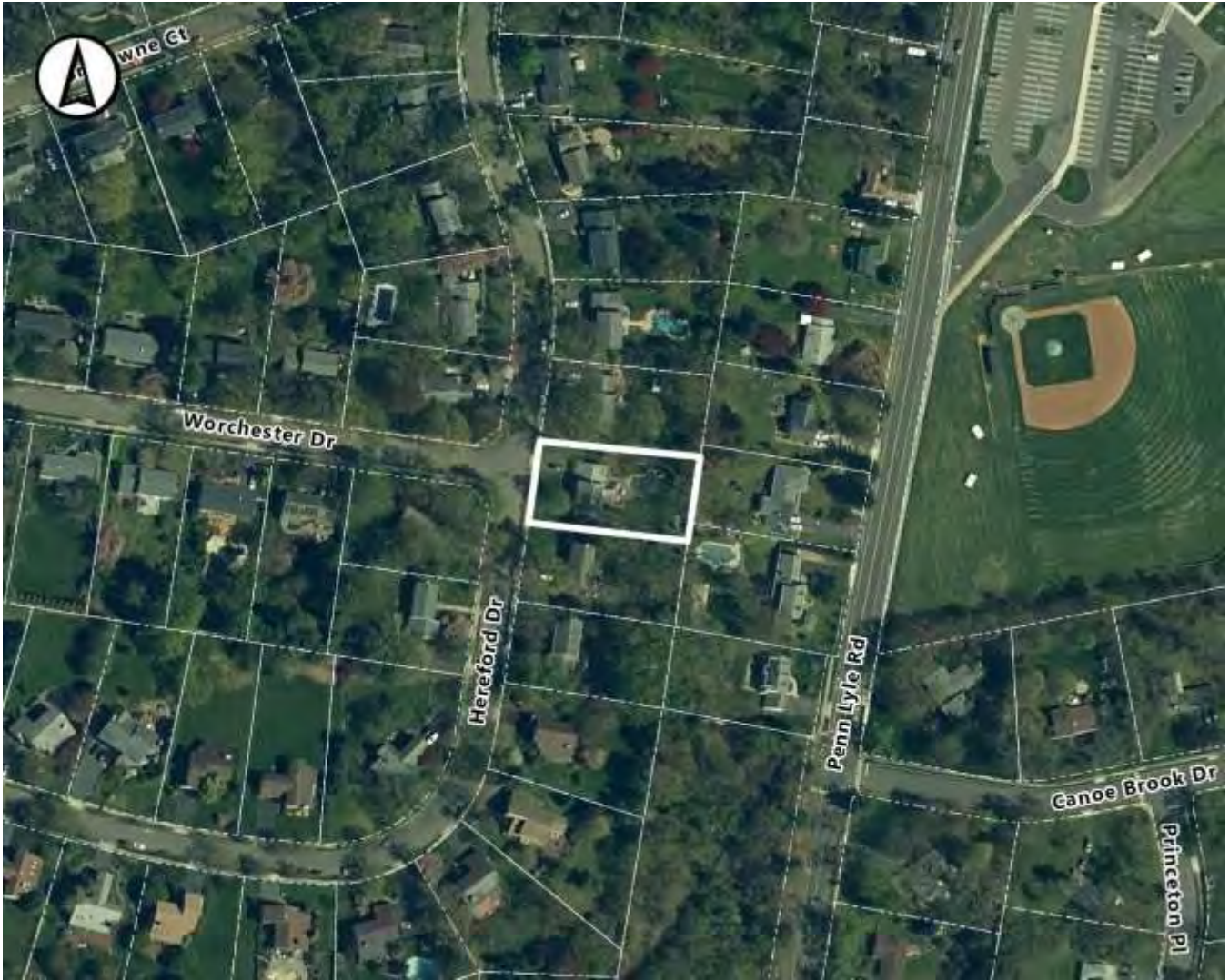
Map 1: Aerial of Subject Site (scale: 1" = 200')

https://burgis.sharepoint.com/sites/BurgisData/Shared Documents/W-DOCS/PUBLIC/Pb-3700series/Pb-3789.18/PB 3789.18 Eve and Scott Gelade - d(4) Variance (ZB 21-02).docx