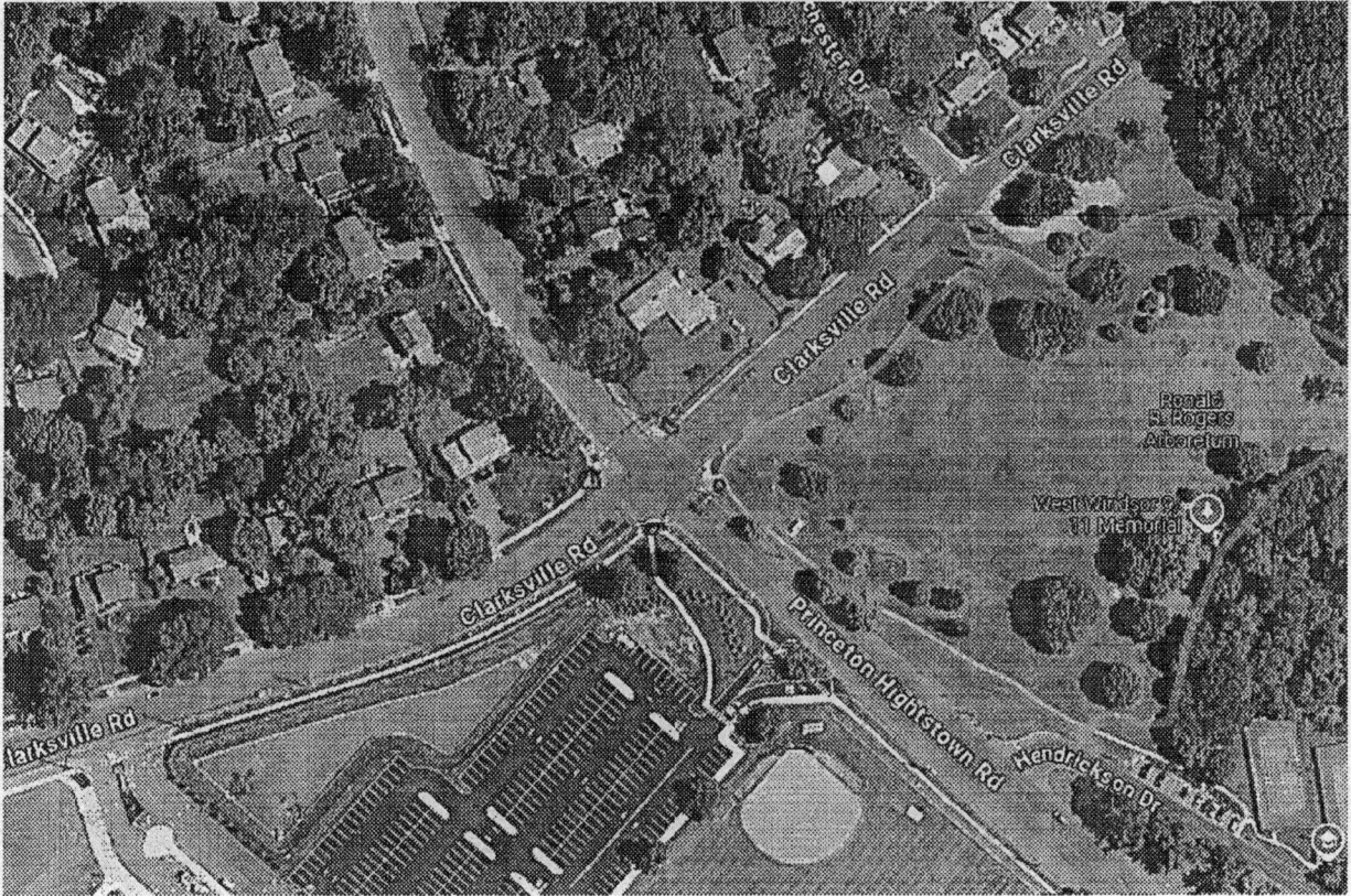
Location – Princeton Hightstown Road (CR 571) at Clarksville Road (CR 638)