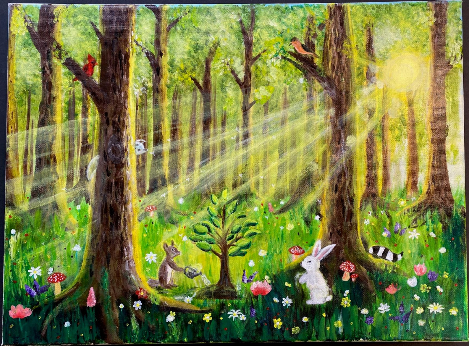
West Windsor Arbor Day Art Contest – 2024 6 th - 8 th Grade– Runner Up by Meijun Y.