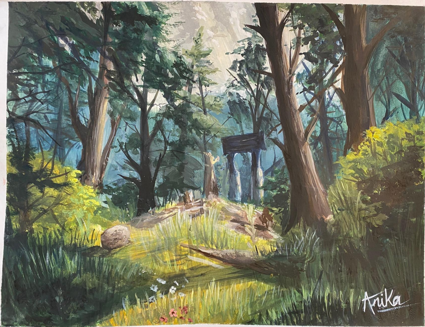
West Windsor Arbor Day Art Contest – 2024 6 th - 8 th Grade– First Place by Anika B.