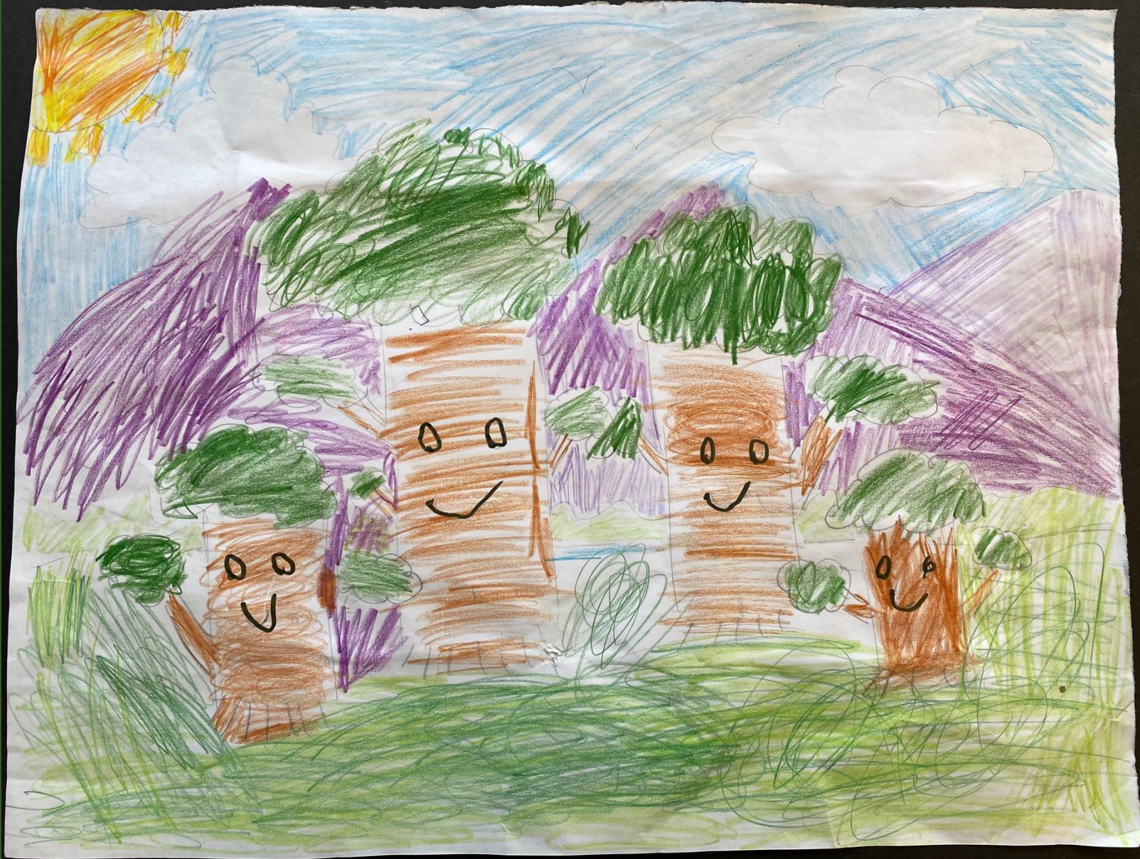
West Windsor Arbor Day Art Contest – 2024