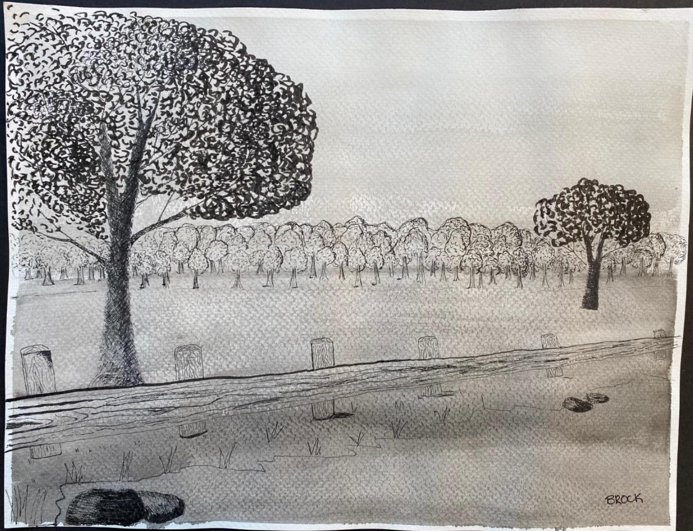
West Windsor Arbor Day Art Contest – 2024 6 th - 8 th Grade– Runner Up by Brock A-W.