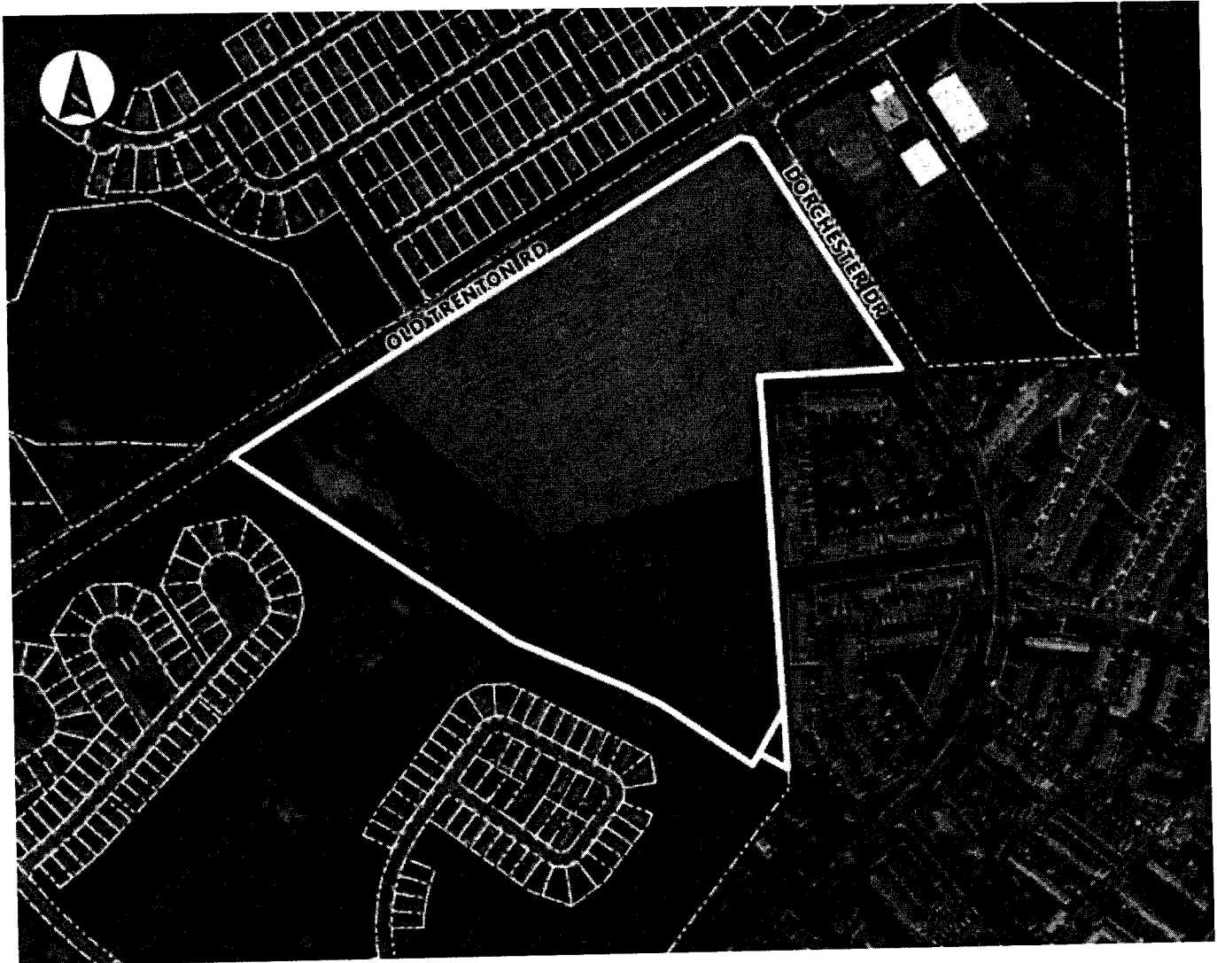
Map 1: Aerial of Subject Site (scale: 1" = 500')

Section 200-27B.(2) establishes that bicycle parking shall be required at a ratio of one (1) space for each twenty (20) parking spaces or fraction thereof. The applicant has indicated that a total of three hundred and thirty-three (334) parking spaces are proposed, which would require seventeen (17) parking spaces. Bicycle parking spaces will be internally located in each market-rate unit garage, as well as in the garages/storage spaces for the affordable units. An additional bicycle rack is to be located near the clubhouse.