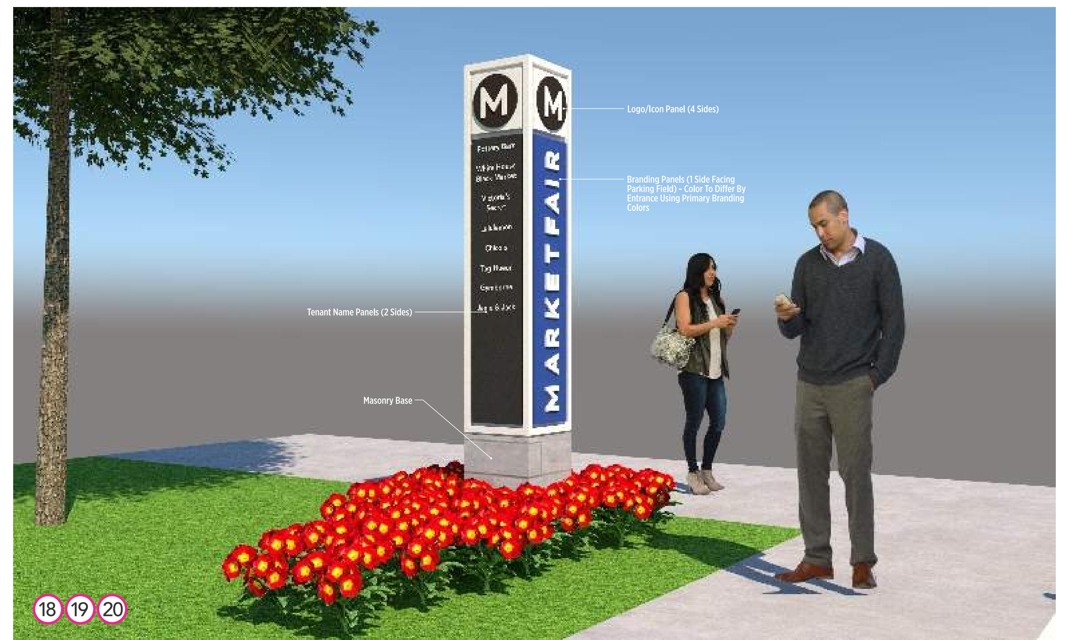
All Designs/Sizes Subject To Review & Approval By Local Zoning